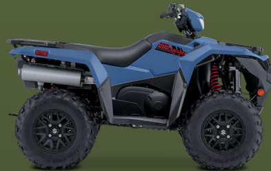
Armored Blue Gray

The KingQuad 750AXi Power Steering SE is not just an ATV, it's a KingQuad ATV. Suzuki, the inventor of the 4-wheel ATV, has created the world's best sports-utility quad with bold styling plus more capability and reliability than ever before. The legacy of the iconic KingQuad remains fresh and exciting and is ready for riders to join its history. The 2025 KingQuad 750AXi Power Steering SE helps tackle challenging terrain with the capabilities that only a KingQuad possesses.